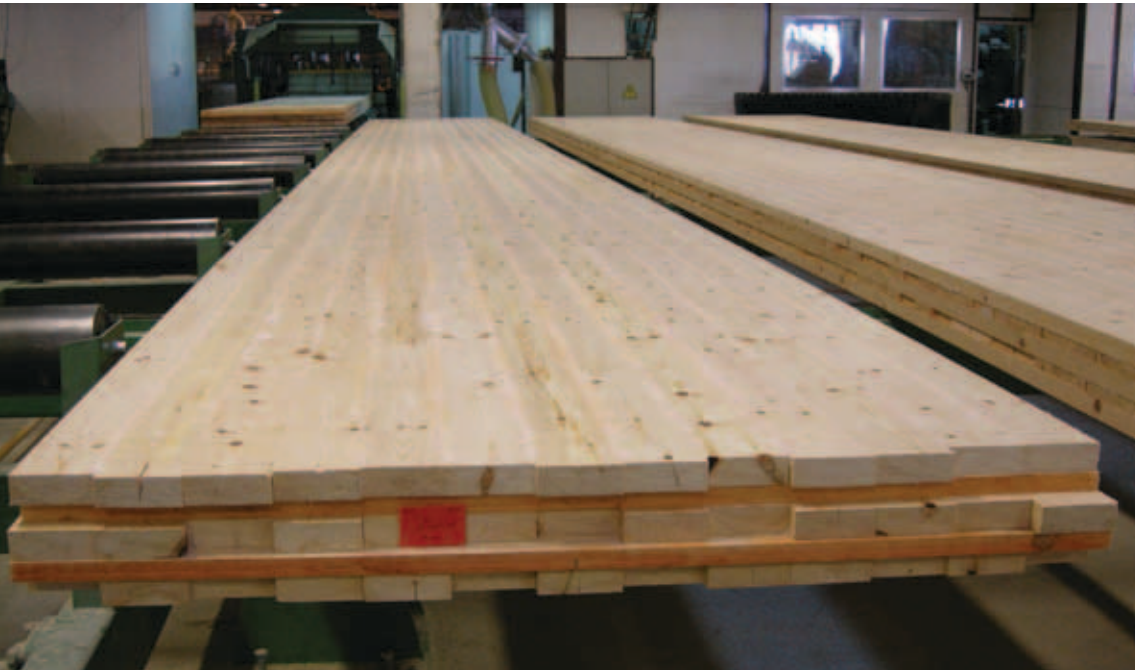
Above: The laminates that make up the panels are pieces of dimension lumber, such as 1 x 4, 1 x 6, or 2 x 4, 2 x 6 or similar, and are either glued using radio-frequency presses or fastened to each other. The lumber is stacked in its flat orientation into 3-, 5-, 7-layers or more on a forming bed and then subjected to uniform pressure using hydraulic or vacuum presses.

record to accurately and efficiently cut and profile conventional solid and glue-laminated wood products. Great idea number two: prefabricate a high-performance product under controlled conditions.